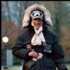
Star Wars Rebel