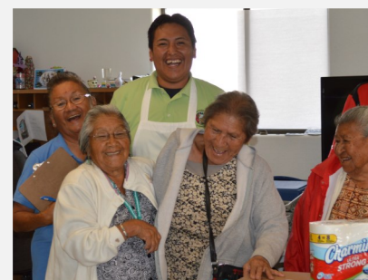
Summer Box distribution at Hopi Nutrition Center