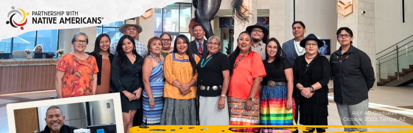
AIEF 4D Graduates October 2023, Tempe, AZ