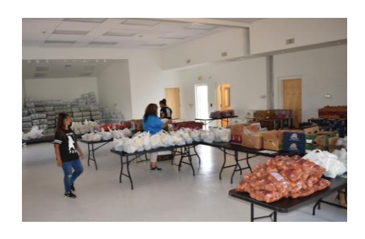
Food Distribution Set Up