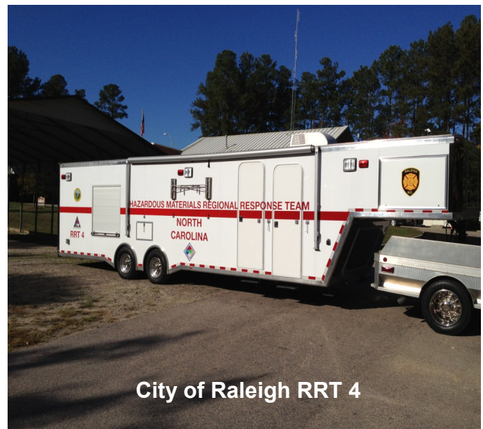
City of Raleigh RRT 4

Captain Ian Toms states that the trailer has multiple applications and the trailer was purchased with a Department of Homeland Security 2008 federal grant .