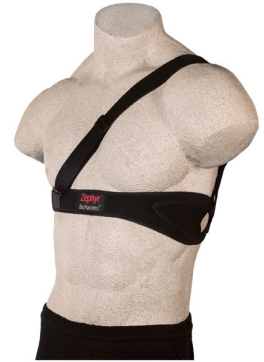
The RAE Systems BioHarness includes ECG and breathing rate sensors for real-time portable physiological monitoring. The BioHarness links to a RAELink3 portable modem to transmit sensor readings and GPS coordinates to a PC running the RAE Systems ProRAE Guardian safety monitoring software

The BioHarness consists of a BioModule, the RAELink3 monitor and ProRAE Guardian Software. The BioModule links to a portable modem which enables the wireless radio to transmit sensor readings and GPS coordinates to the PC running the ProRAE Guardian software. This can be coupled with a variety of other safety sensors: Volatile Organic Compounds (VOC), gases, chemical warfare agents and radiation.