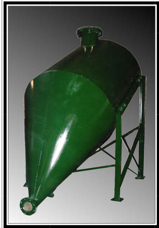
This Alloy Incline Blow Tank avoids tank pits and keeps all operational parts in operator view.

All Alloy Blow Tanks are manufactured to the stringent specifications of the A.S.M.E. Code, assuring you a safe vessel with extended life.