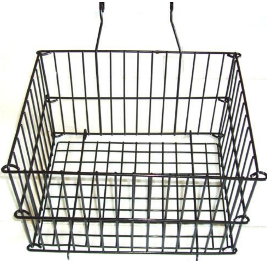
STEP 4 – SWING BOTTOM AROUND AND HOOK OVER