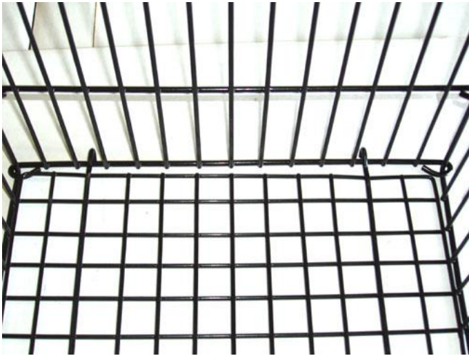
CLOSE UP OF BOTTOM HOOKING OVER SIDE