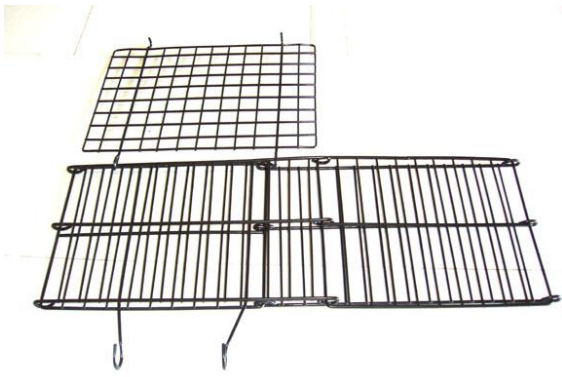
STEP 2 – FOLD BOTTOM UP AS SHOWN IN DIAGRAM