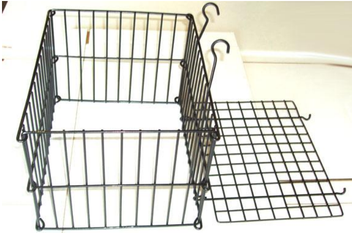
STEP 3 – POP SIDES OF SPORTSBASKET UP