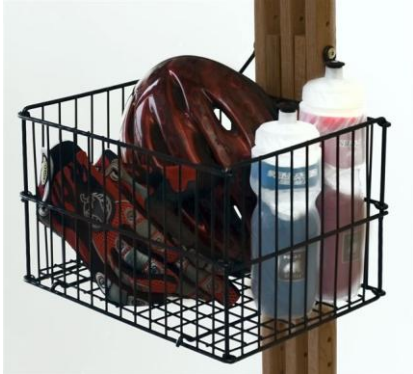
Sports Basket on OAK Rack