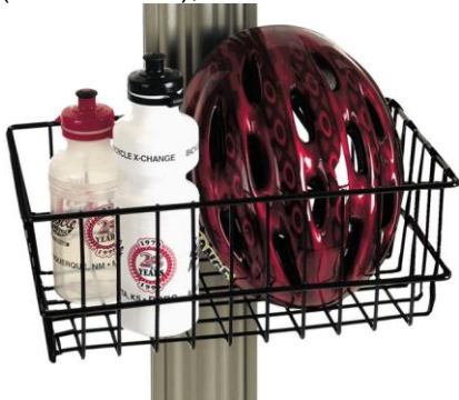
Sports Basket on Aluminum Rack

The GEARUP™ Sports Basket is designed to fit all GEARUP™ Aluminum Floor to Ceiling, GEARUP™ OAK Floor to Ceiling (Model 20095), and GEARUP™ OAK Free Standing (Model 20093) Bicycles Storage Racks.