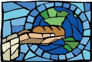
World Communion Sunday