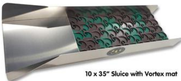
10 x 35" Sluice with Vortex mat

Dream Mat (choose Mini Dream Mat or Vortex Dream Mat) is the first sluice mat ever to be scientifically engineered and designed using advanced fluid dynamic principles and physics. The mini Hydro-Cyclone inspired vortex cells classify, separate, capture and hold gold naturally. Dream Mats vortex cells exploits nature's own forces in a patented system to bring the finest gold recovery ever created. These mini cells are engineered to capture the finest of gold without needing huge amounts of water to maintain good exchange. Big gold is really heavy and Dream Mat captures and holds the bigger gold in its vortex holding