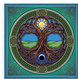
Illumination Art Removeable & Reusable