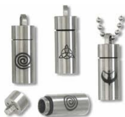
Keep Close Bottles