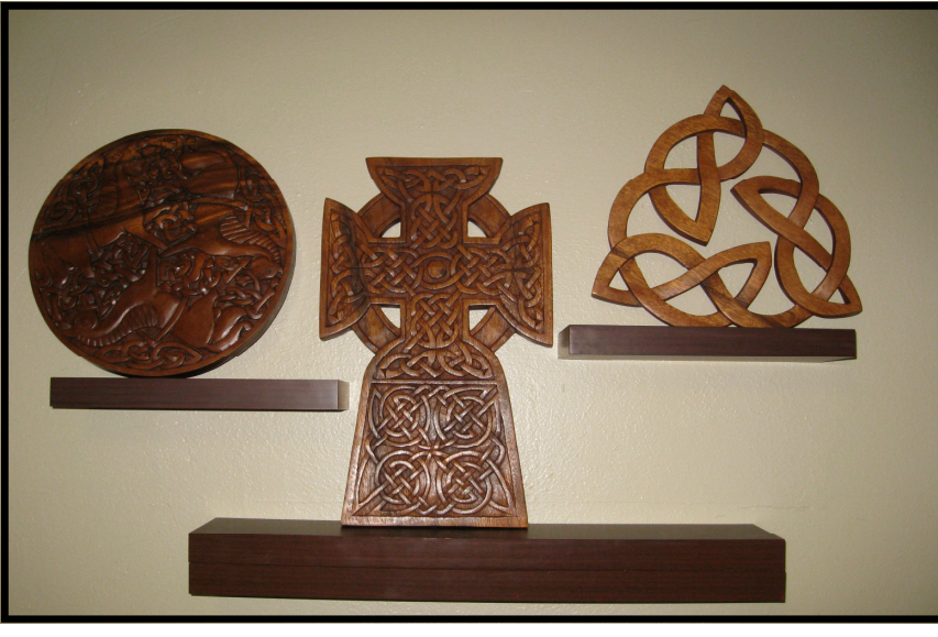
Hand Carved Teak Wall Hangings

Awesome New Selection of Pashmina Scarves in a Variety of Vibrant Colors!