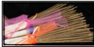
Single Stick Incense