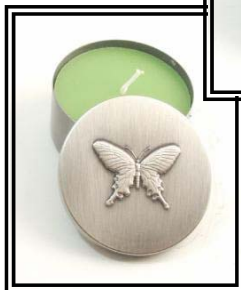
Butterfly & Dragonfly Box Candles