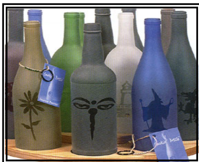
Smokin' Incense Bottles