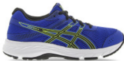
CONTEND 6 GS Junior $89 99