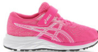
PRE EXCITE 7 PS Junior $89 99