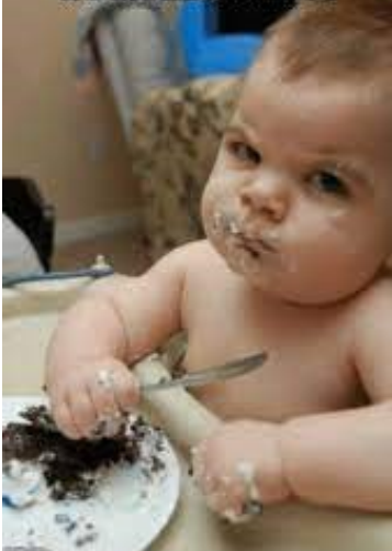
CHURCH OF THE COVERED DISH by Thom Tapp