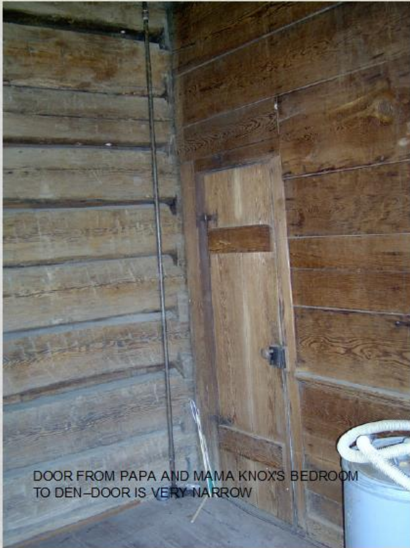
DOOR FROM PAPA AND MAMA KNOX'S BEDROOM TO DEN-DOOR IS VERY NARROW