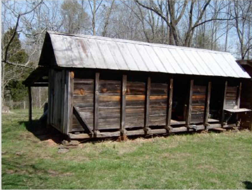
SEED HOUSE (GRAINERY). PAPA KNOX STORED DIFFERENT TYPES OF SEED IN THIS BUILDING.