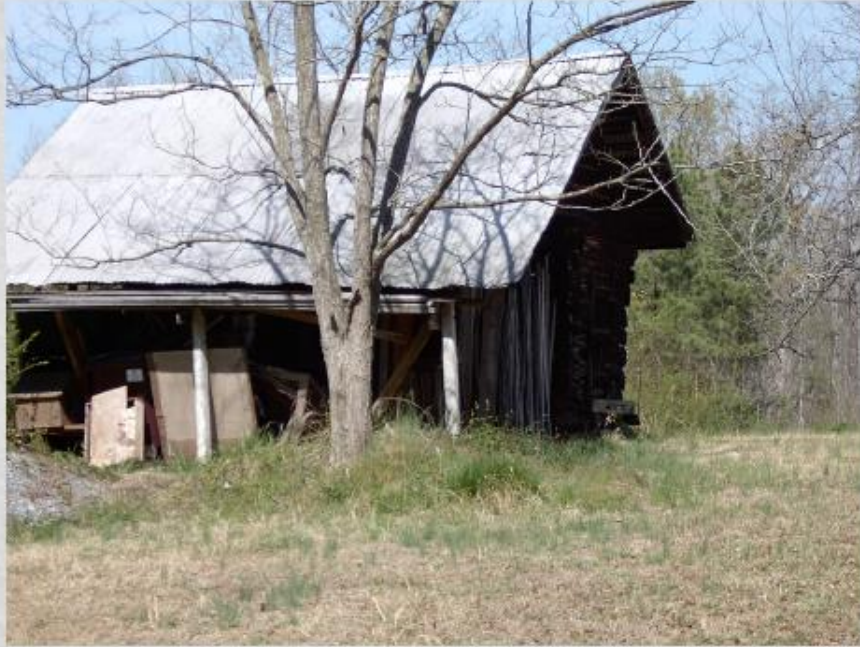
DIFFERENT VIEW OF WAGON SHELTER