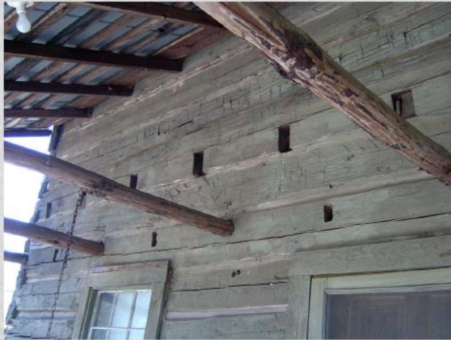
VIEW FROM PORCH SHOWING HOLES FOR CEILING JOISTS (LOWER HOLES WERE FOR PORCH SUPPORTS) THE ROUND SUPPORTS WERE PLACED BY PRESENT OWNERS.