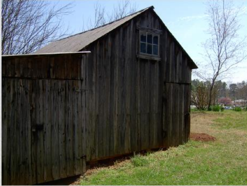
SMOKE HOUSE. PORK WAS SALTED DOWN IN A LARGE BOX FOR SIX WEEKS THEN HUNG FROM THE RAFTERS AND SMOKED IN THIS BUILDING