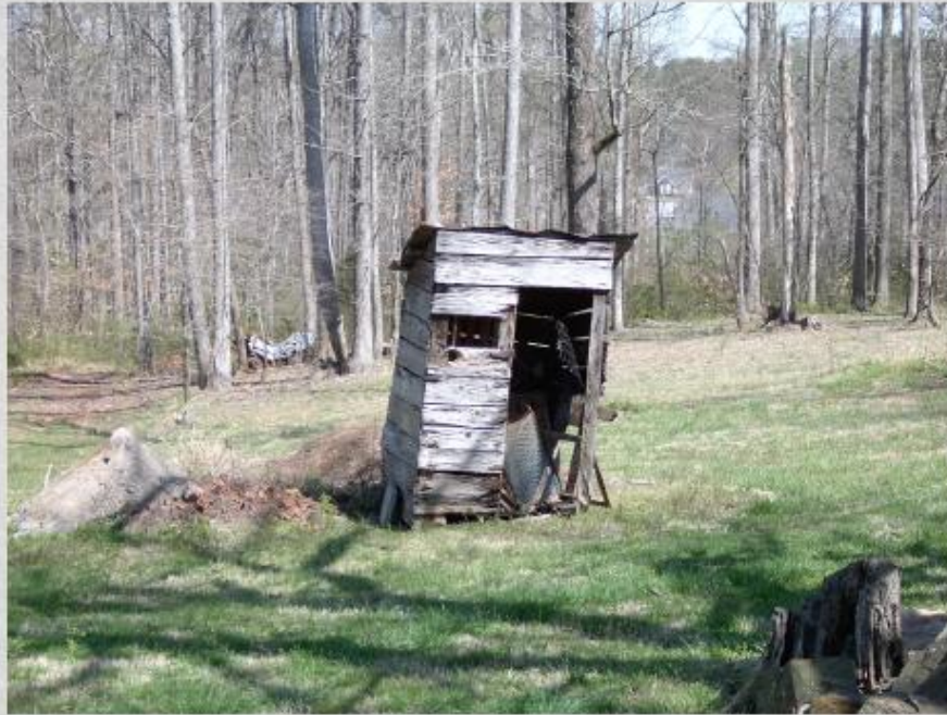
OUT HOUSE (TOILET)