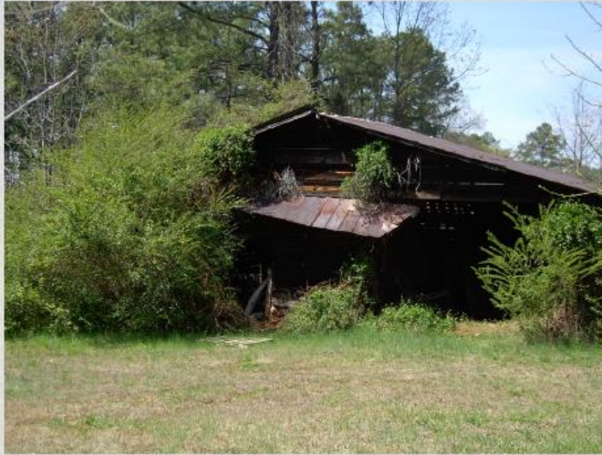
CORN CRIB AND STORAGE BUILDING. A BUILDING LOCATED BEHIND THIS BUILDING WAS DESTROYED IN 1936 BY A TORNADO (KNOWN AS THE SHUCK HOUSE)