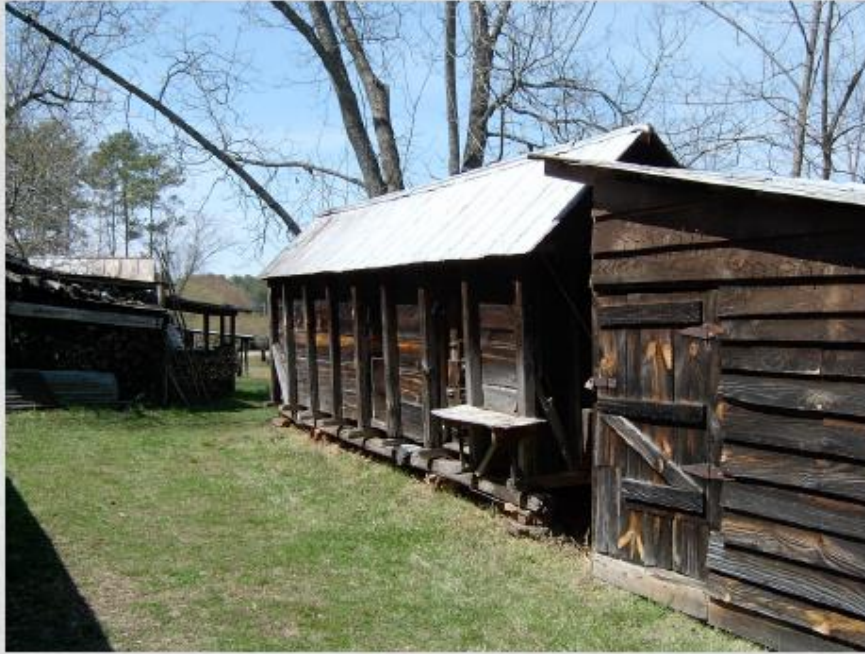
DIFFERENT VIEW OF SEED HOUSE. THE BUILDING ON THE RIGHT WAS REMOVED FROM THE WAGON SHELTER AND LOG STORAGE BUILDING AND MOVED TO THIS LOCATION.