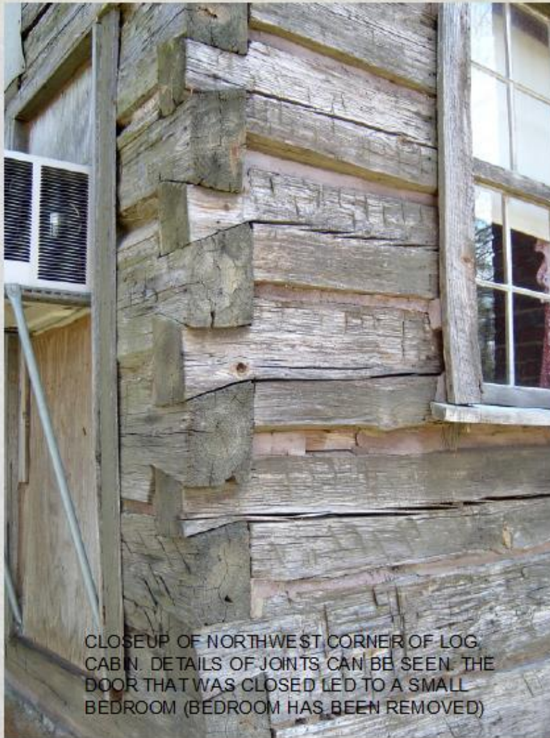
CLOSEUP OF NORTHWEST CORNER OF LOG CABIN. DETAILS OF JOINTS CAN BE SEEN. THE DOOR THAT WAS CLOSED LED TO A SMALL BEDROOM (BEDROOM HAS BEEN REMOVED)