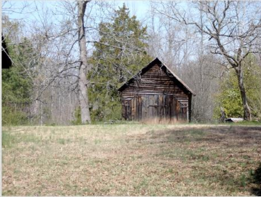
ANOTHER FIEW OF CAR HOUSE (GARAGE)