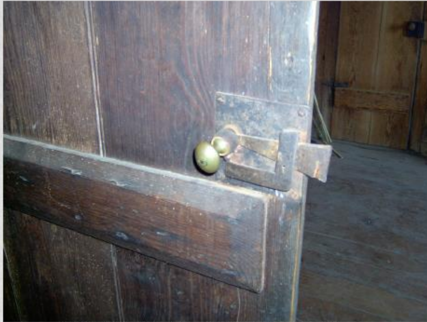
DOOR HANDLE AND LATCH FROM PAPA AND MAMA KNOX'S BEDROOM TO LIVING ROOM (LIVING ROOM IS THE LOG CABIN)