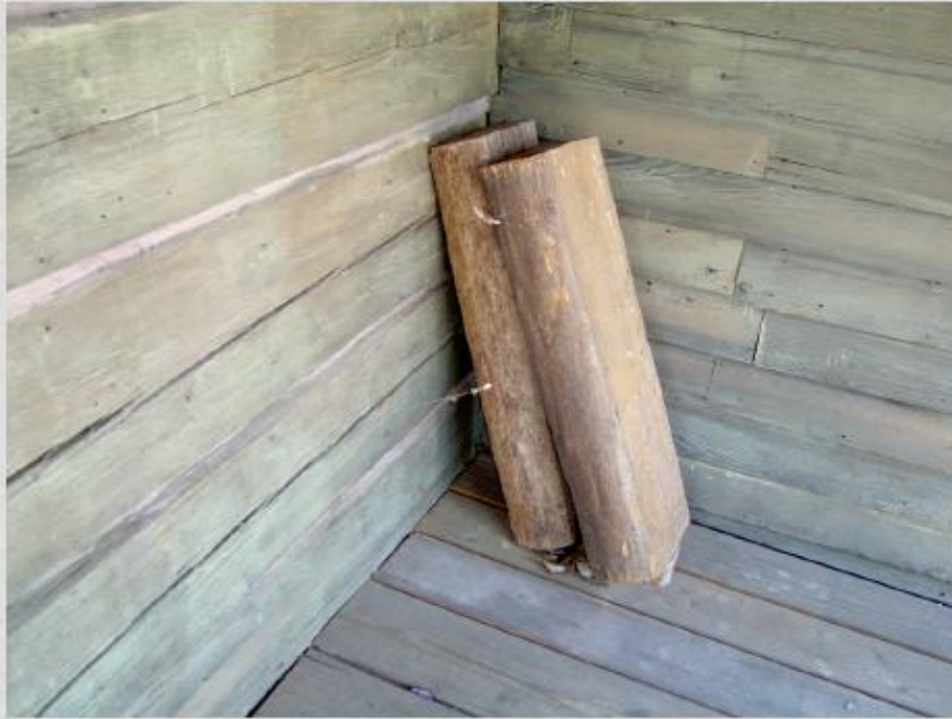
PART OF TWO LOGS REMOVED FROM LOG CABIN DURING REMODELING BY PRESENT OWNERS.