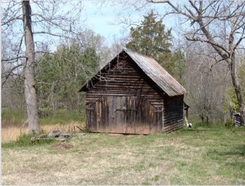
CAR HOUSE (GARAGE/CARRIAGE HOUSE)