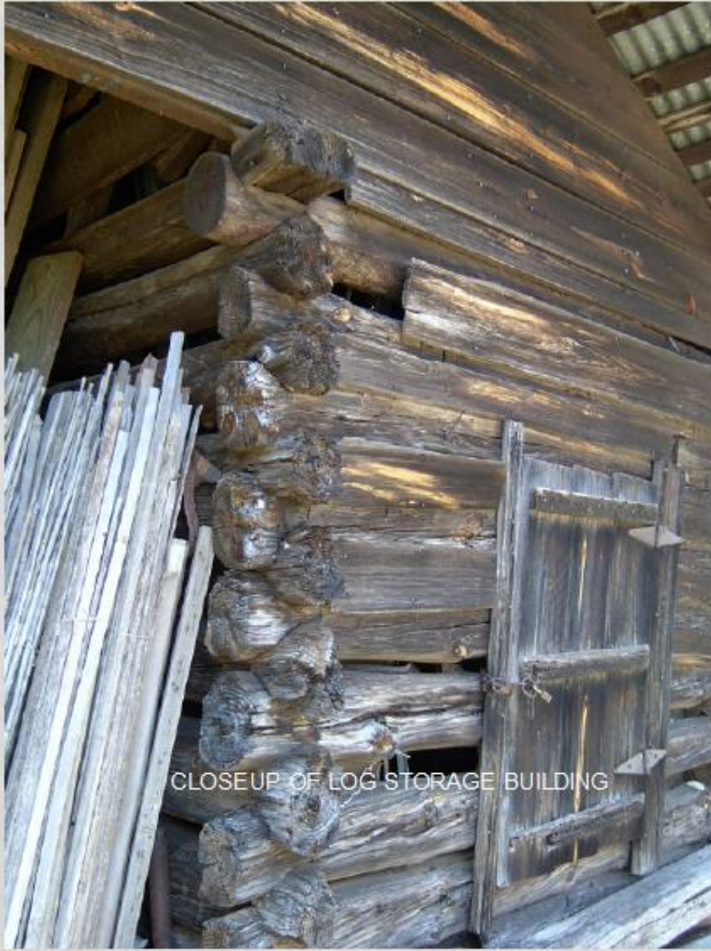
CLOSEUP OF LOG STORAGE BUILDING