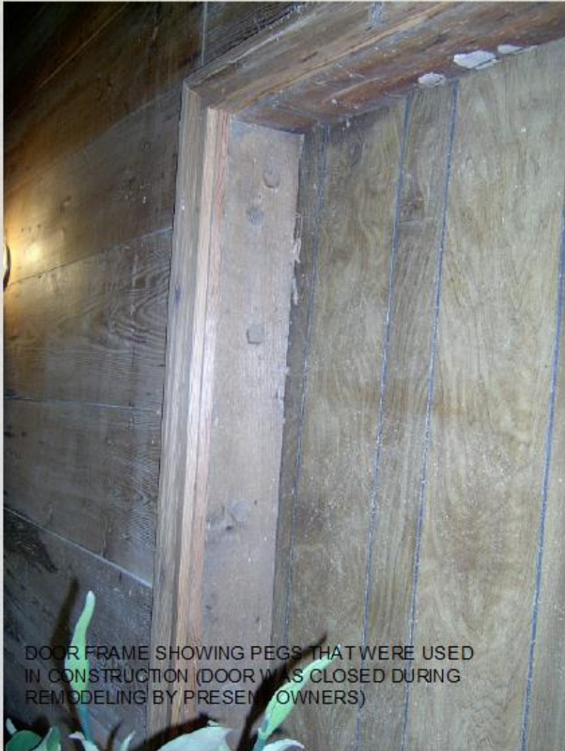
DOOR FRAME SHOWING PEGS THAT WERE USED IN CONSTRUCTION (DOOR WAS CLOSED DURING REMODELING BY PRESENT OWNERS)