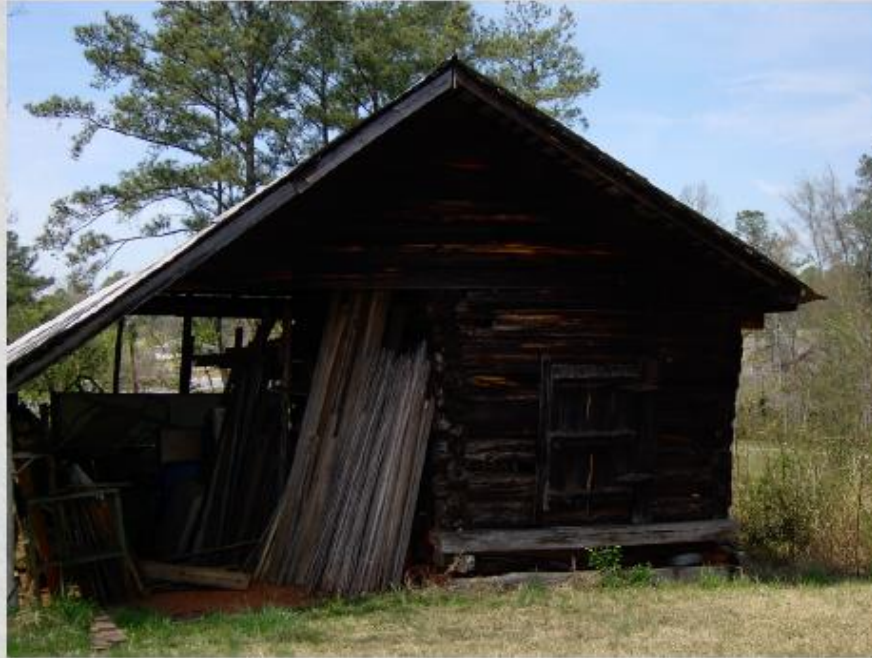
WAGON SHELTER AND LOG STORAGE BUILDING