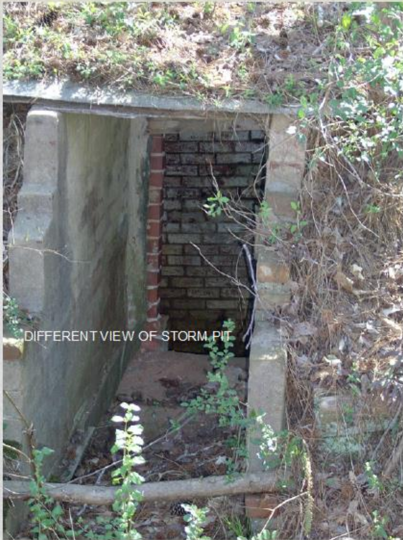
DIFFERENT VIEW OF STORM PIT