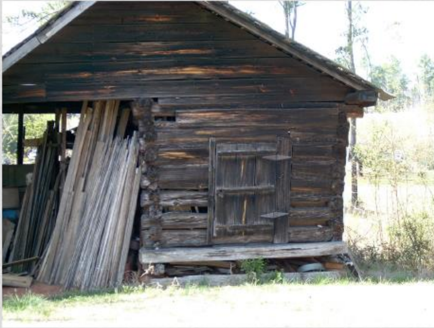
A CLOSER VIEW OF WAGON SHELTER AND LOG STORAGE BUILDING