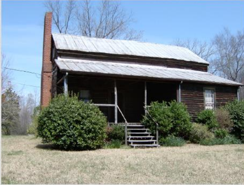
KNOX HOME-- LEFT SIDE IS LOG CABIN RIGHT SIDE WAS HENRY KNOX'S BEDROOM