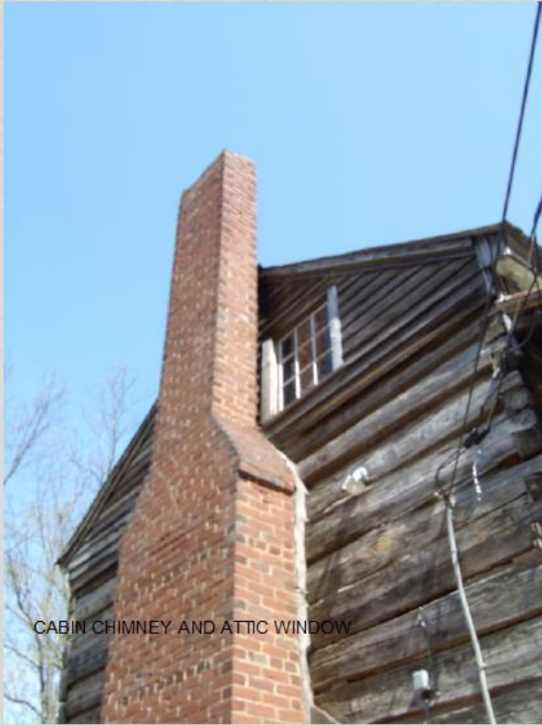
CABIN CHIMNEY AND ATTIC WINDOW