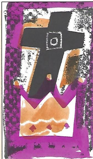
Crown and cross: Symbolize the reward in eternal life to those who believe in the crucified Savior. "Be thou faithful unto death, and I will give thee the crown of life." (Rev. 2:10 KJV).

God of life, you make all things new through the death and resurrection of your Son. Use us as witnesses to tell this wonderful good news to those who are in special need, that they might see the risen Christ clearly in their lives, we pray in Jesus' name. Amen