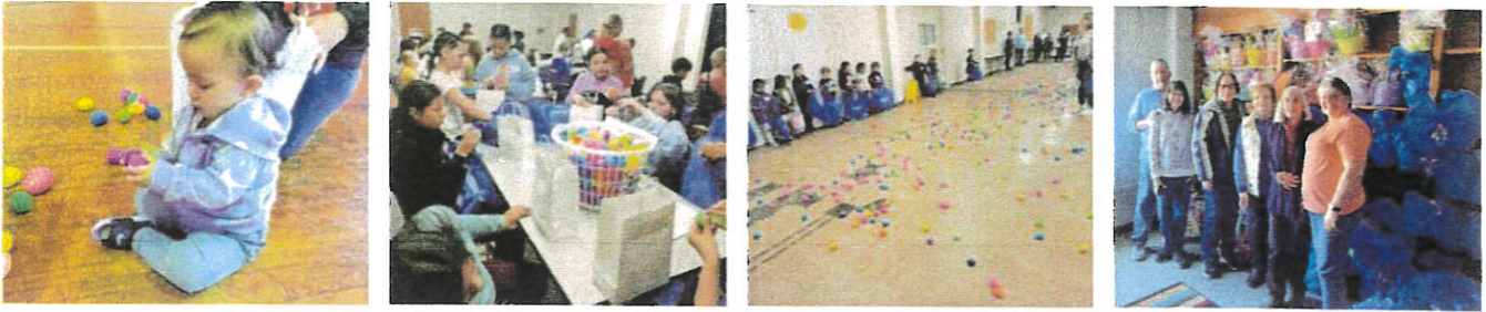
Moore Activity Center – Page 2

Regular ministries continue to be a blessing. Many in our churches help with these ministries as well. From volunteering for one-time events and weekly ministries to helping provide food for ministries. The way the NKBA Churches step up to help us do ministry at the Moore Activity Center is so appreciated.