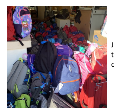
Just a sampling of the 912 backpacks collected!

In November and December 2021, the NKBA office received 912 backpacks filled with gifts for children in our area. Backpacks went to the Moore Activity Center, Lighthouse Ministries, First Baptist Church and SEND Cincinnati ministries. We were also blessed to be able to share our extras with associations in other areas of Kentucky, as well as sending the remainder to the Western Kentucky tornado relief efforts. Thank you to all of the NKBA churches that participated in our backpack collection. Plans are already underway for the 2022 project!