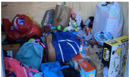
Backpacks and toys headed to Western Kentucky!