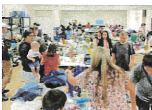
Free Yard Sale