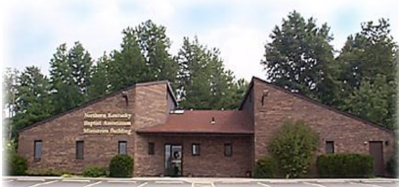
3001 Riggs Avenue ~ Erlanger, KY 41018 ~ 859.727.6522

Visit us on the web at www.nkbaptist.org Or Northern Kentucky Baptists on Facebook Office Phone: 859.727.6522