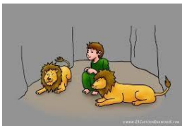
Jan 31 - Daniel in the Lion's Den