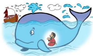
Feb. 7 - Jonah & the Whale