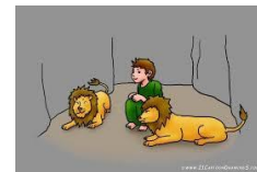
Jan 31 - Daniel in the Lion's Den