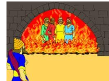
Jan 24 - Daniel's friends in the fiery furnace