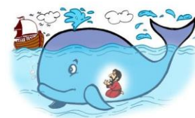
Feb. 7 - Jonah & the Whale