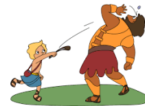
Jan 17 - David & Goliath

Your kids are especially going to want to get their hands on the upcoming lessons: