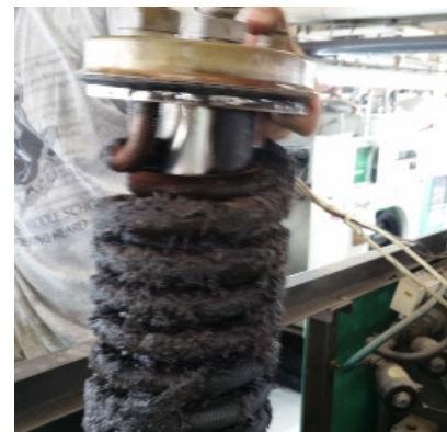
Lint can build up quickly

These are equally important because if the air sensors are clogged they may give false readings, which may extend drying times. Other routine maintenance that should be performed include changing out check valves, sensors and cleaning your coils. You should also take apart your solvent pump, clean and inspect it. These things are all equally important, but only need to be done on annually. Just remember, some of these more technical issues should be handled by an experienced mechanic.