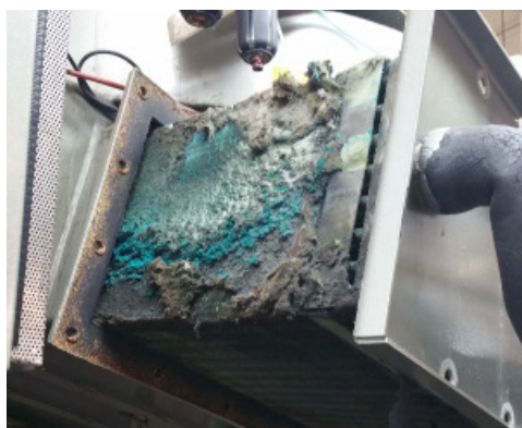
In need of Maintenance

How does an oil change relate to my dry cleaning business? It