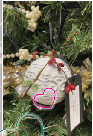
The most beautiful thing you can wear is Confidence

Ladies, whether you are a registered technician, Certified Operator, an administrative employee, manager, or owner we invite you to join us for the upcoming quarterly events we have planned. You will enjoy the friendship of others and take away valuable information to continue to improve in your personal and professional life.