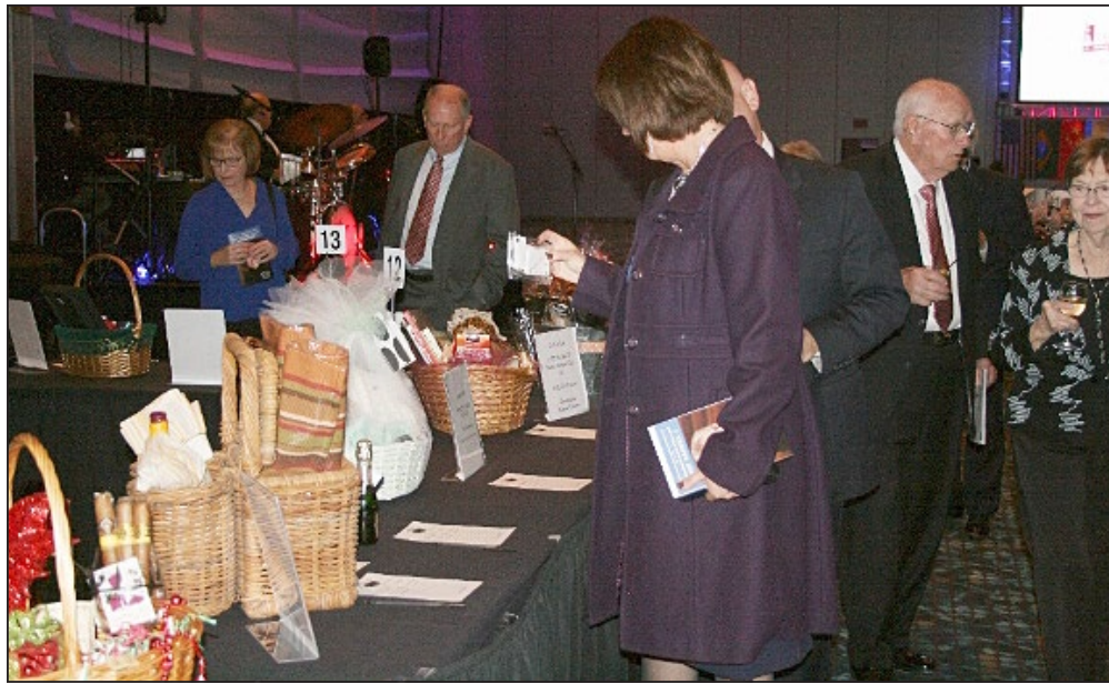
The auction had lots of unusual items from one-of-a-kind bottles of wine to Royals souvenirs.

And special thanks to our members and guests who attended. It was a great evening to socialize, renew old friendships, and create new ones.