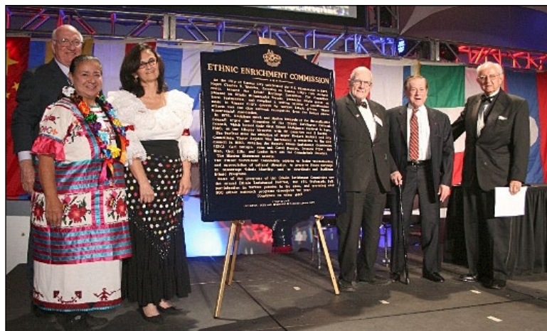
Members of the Ethnic Enrichment Commission accept the marker at the Outstanding Kansas Citian Gala.