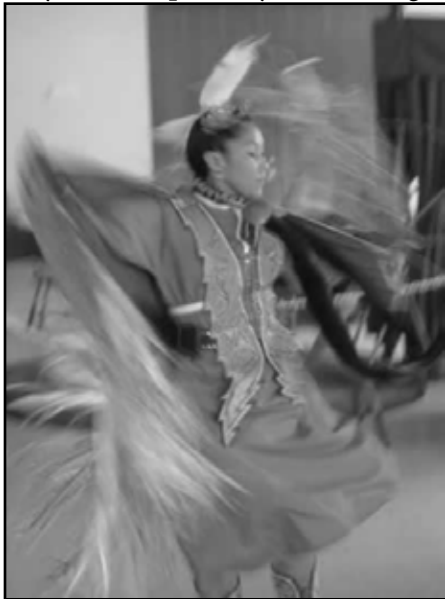
A Big Soldier Creek dancer performing at the dedication