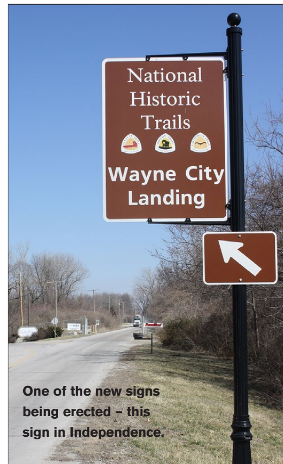
One of the new signs being erected – this sign in Independence.

All the above is why the NHT Workshop will be located here. Registration and other details can be found on the Partnership's website at pnnts.org .