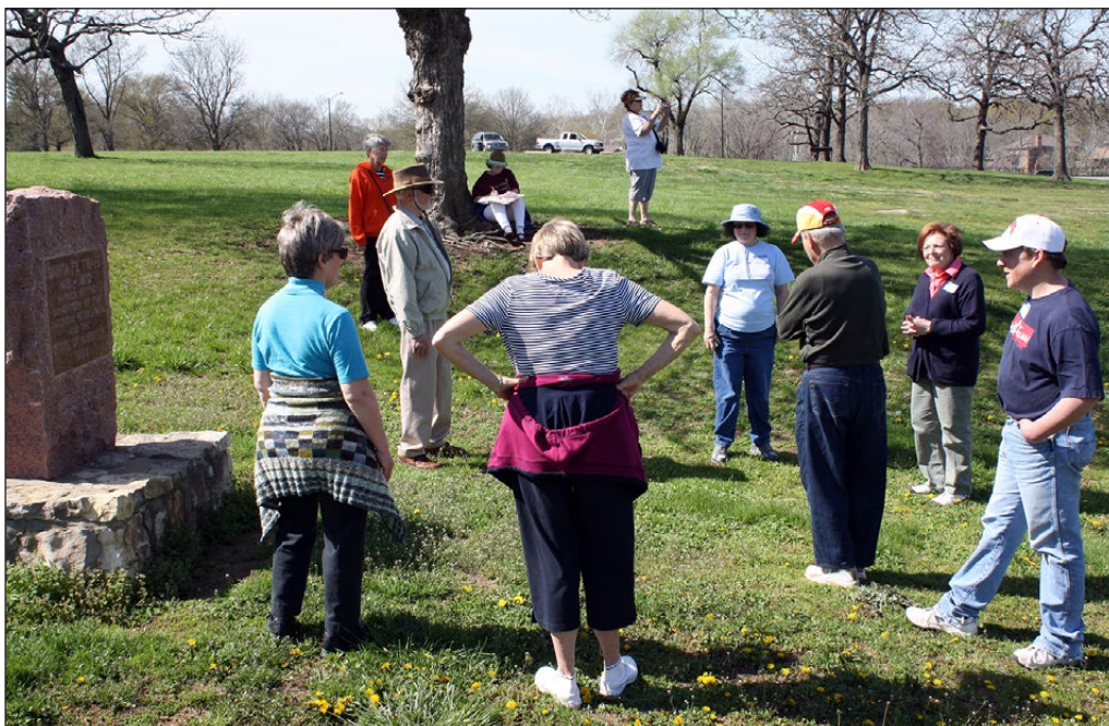
Trail preservationists look at a big swale in Minor Park during a Trails Head Chapter outing in 2013.