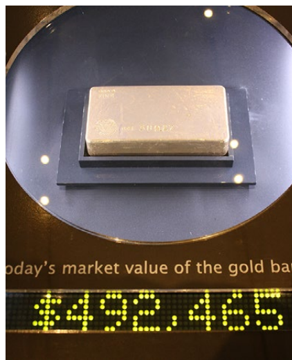
At left is a brick-sized gold bar that weighs 27 pounds, worth the value shown