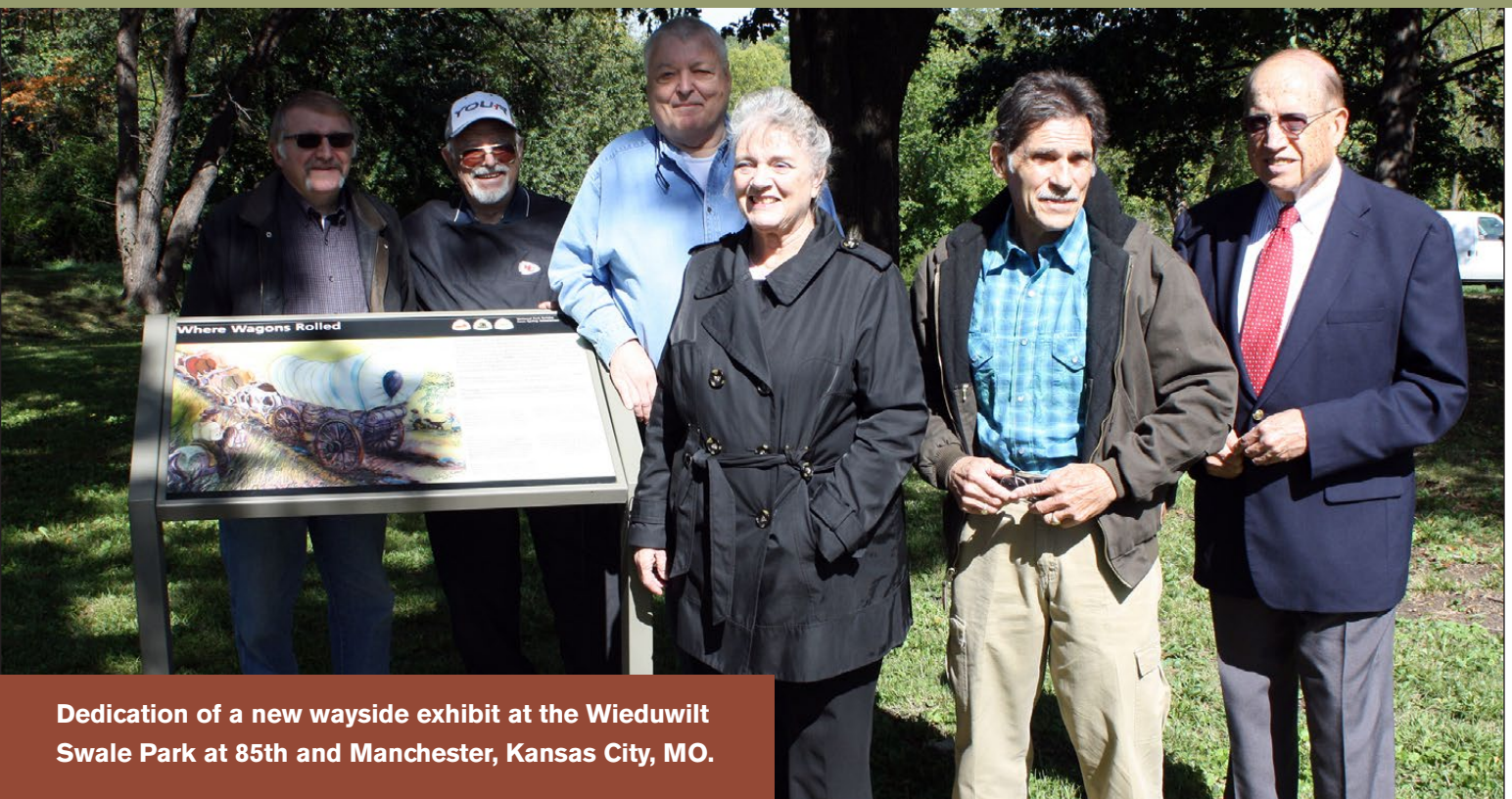
Dedication of a new wayside exhibit at the Wieduwilt Swale Park at 85th and Manchester, Kansas City, MO.