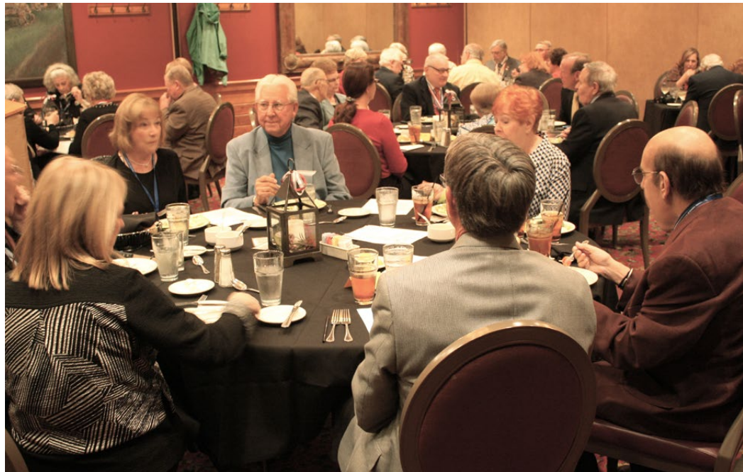
A good turnout!