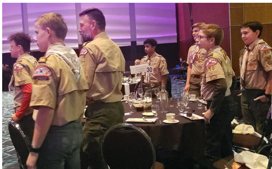
In recognition of the Boy Scouts marker, several Boy Scouts attended with their leader, to help with set-up and coat checking-in. It was good to have them with us!