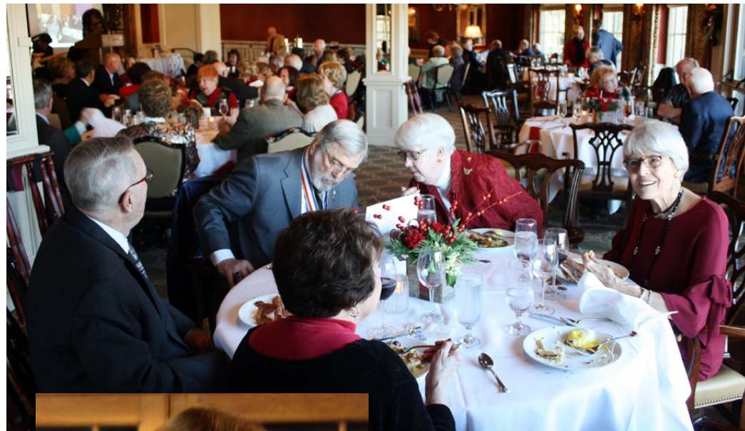
Above: Members enjoy a buffet brunch at the Carriage Club.