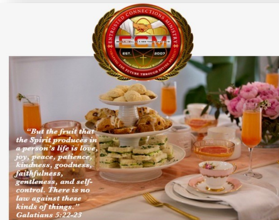
Entrusted Connections Ministry High Tea Celebration