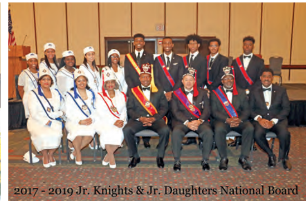
2017 - 2019 Jr. Knights & Jr. Daughters National Board