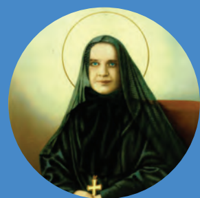
Frances Xavier Cabrini Patron Saint of Immigrants

(Compiled by the USCCB and Justice for Immigrants)