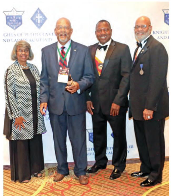
Grand Knight of the Year