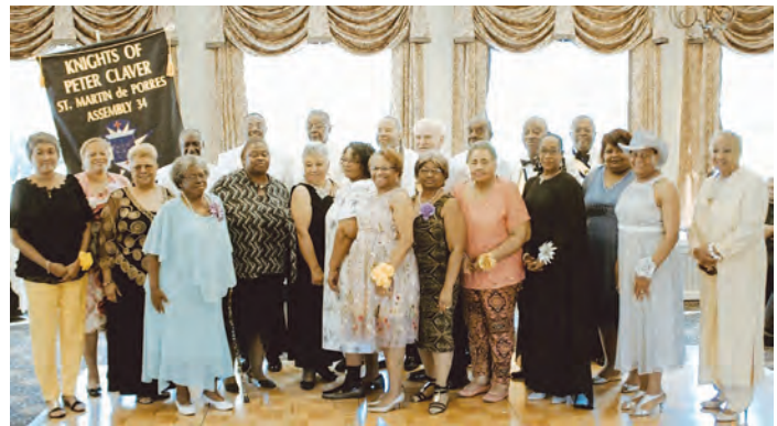
2017 Centennial 4th degree Planning Committee.