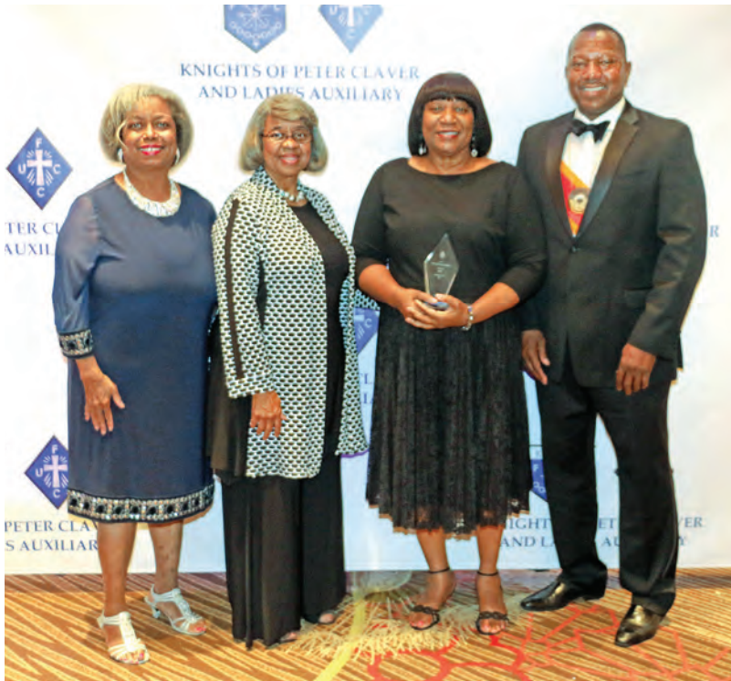
Court of the Year