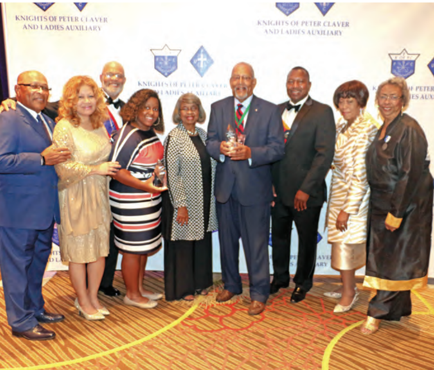
Family of the Year