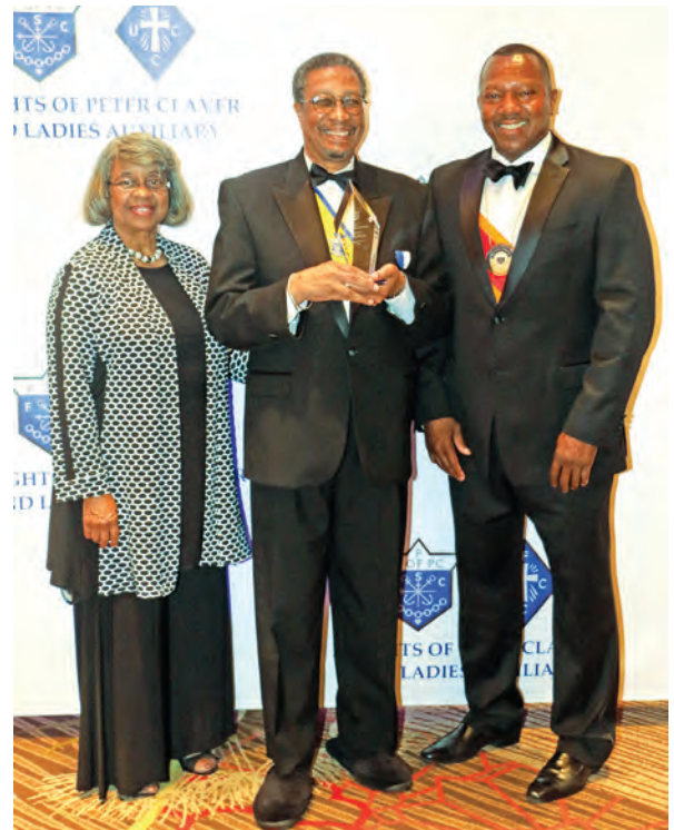
Council of the Year