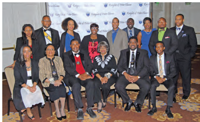
Pictured are some Emerging Leaders with the Past Supreme Knight, Supreme Lady, Past Supreme Lady, and Executive Director at the 2015 Junior National Convention.