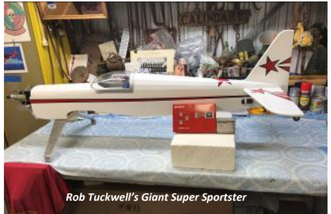
Rob Tuckwell's Giant Super Sportster

relocated to fuselage rather than in the wings, aircraft grade 4 mm aluminium main gear, OS160 2 stroke up the front. Rob sadly lost one of his Stick aircraft a few weeks ago, the right-hand turn from base to final saw the plane just keep rolling right. (Good to report that Rob "Hop Harrigan" Tuckwell has flown the big Sportstar.)