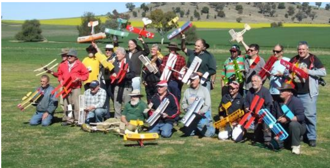
Fli-Biers with their Fli-Bis

Fli-Bi is a 22" free flight biplane and in all twenty nine turned up at Oily Hand. They were powered by a variety of diesels from the newly released Redfin Millish .5cc to an original 1948 Mills P75. Most of the Fli-Bi's were in the original F/F format, but some had radio assist and others were scaled up somewhat.