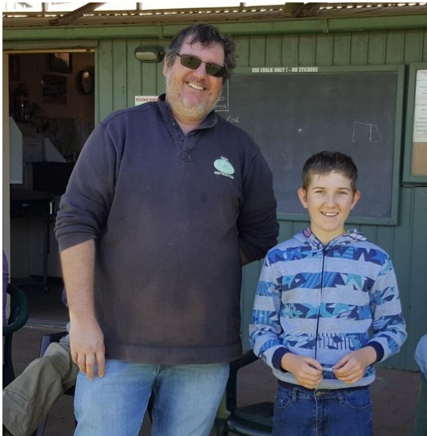
Full story page 4.